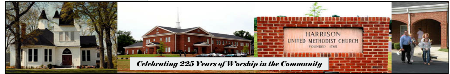
Celebrating 225 Years of Worship in the Community