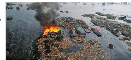
Houses are swept by water following a tsunami and earthquake in Natori City in northeastern Japan, March 11, 2011.