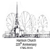
Harrison Church 225 th Anniversary 1785-2010