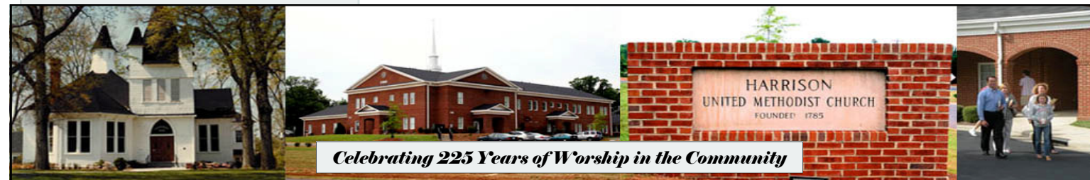
Celebrating 225 Years of Worship in the Community